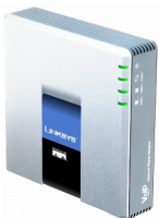
Linksys VoIP Phone Adapter