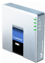
Linksys VoIP Phone Adapter